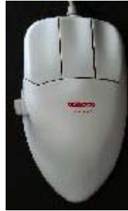
Figure 2. Contour mouse.

The Contour mouse was also designed to minimize biomechanical load and to reduce hand and arm deviations from neutral (Contour Design, 1996). It's top surface has a raised point contoured to the palm of the hand to disperse pressure across the palm during use. The height of one side of the mouse is lower to minimize hand pronation; a support is provided for the thumb (see Figure 2)