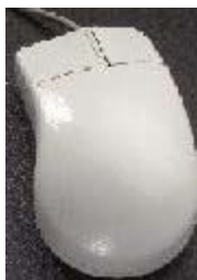
Figure 1. Microsoft mouse

The Microsoft mouse (see Figure 1) was designed to minimize muscle load during use (Adams, et al., 1994). It differs from a traditional mouse in its higher height, kidney shape, lateral button pitch, and top surface which better conforms to shape of the hand than a traditional mouse.